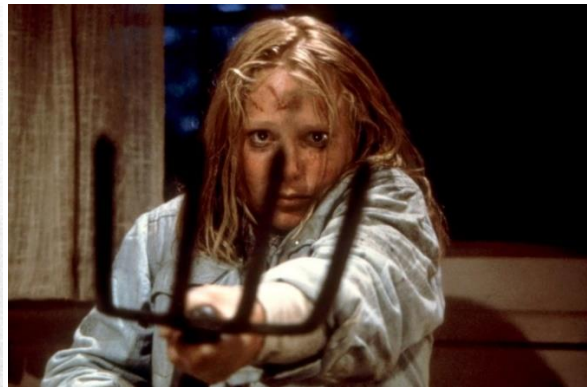
Amy Steel in Friday The 13 th Part II (1981)